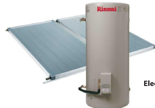
Electric Boosting Solar