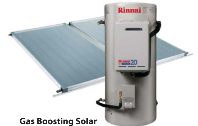
Gas Boosting Solar

If it is early morning then the gas booster will be required, but if later in the day, some solar reheating will have occurred. Regardless of whether your hot water is used in the mornings or evenings, gas boosting is the most efficient, convenient and cost effective boost option. Gas boosters operate only on demand and have the additional benefit of never running out of hot water.